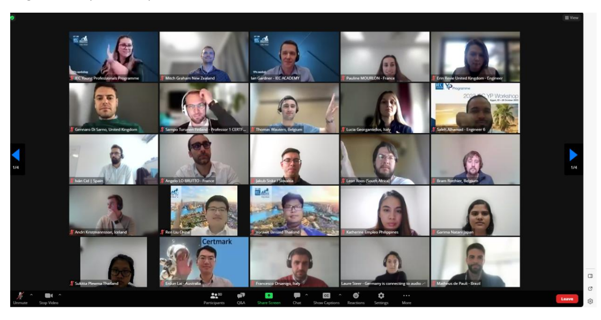
Day 2 - Monday 23<sup>rd</sup> October

We then had in introduction to the breakout sessions to understand the objectives of these sessions. It involved collaborating with other YPs to brainstorm and deliver our ideas to the IEC General Assembly on our particular initiatives. The initiative I was working on was Paving the way for the future - Long Term Sustainability (LTS) of the IEC. The intent of this initiative was to explore how the IEC could ensure a future pipeline of subject matter experts and maintain relevance in the electrotechnical space. This was a great opportunity to get to know other YPs and get a diverse range of perspectives of how to tackle this challenge. The first session consisted of a brainstorming exercise to get as many ideas as possible identified.