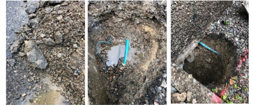
Site after works: