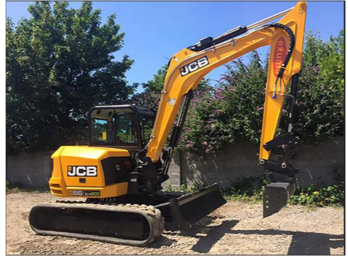
Sample Photo of 8 Tonne 360° Excavator

Work Activity: #excavator #collision #barriers #driversafety #banksman #reversing