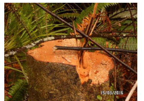
The base of the felled tree (which struck the worker).