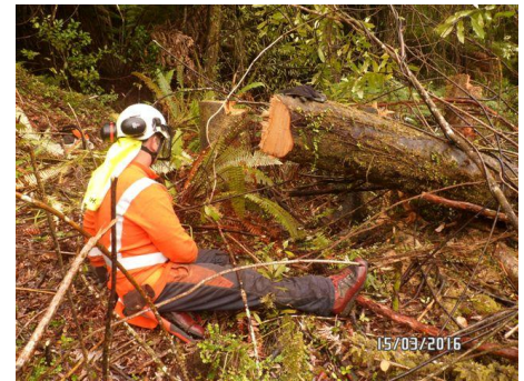
Re-enactment of the position the injured worker fell.