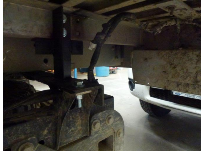
Underside of Truck Deck

This movement could affect the handling of the vehicle and also cause the chassis brackets to bend if they were not repaired. Subsequent investigations showed the original brackets were of insufficient strength. They have since been modified.