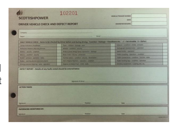
VC40 Driver Vehicle Check And Defect Report

As the driver was not under the influence of drugs or alcohol, had not been using his phone, was complying with the speed limit and had completed his Driver Vehicle Checks report and tachograph that morning, the police were able to quickly eliminate the SPEN driver and vehicle from their inquiries absolving them of any blame or involvement in the incident.