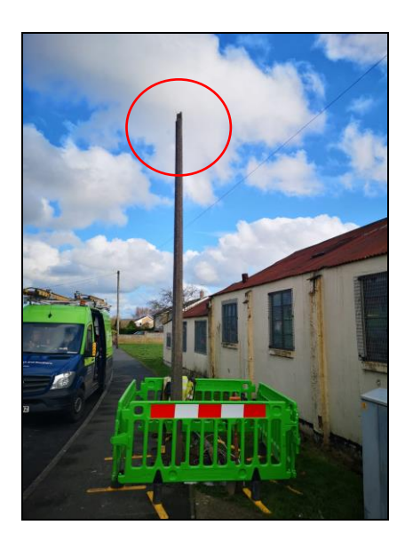
Chunk of failed concrete from lighting column caused the top extension arm to fall to ground

Our colleagues were not in contact with the column at the time of the incident, they were however excavating close to the column and it is believed that vibrations through the ground and into the lighting column potentially caused a latent defect to worsen and the column failed. The photographs below show the point of failure.