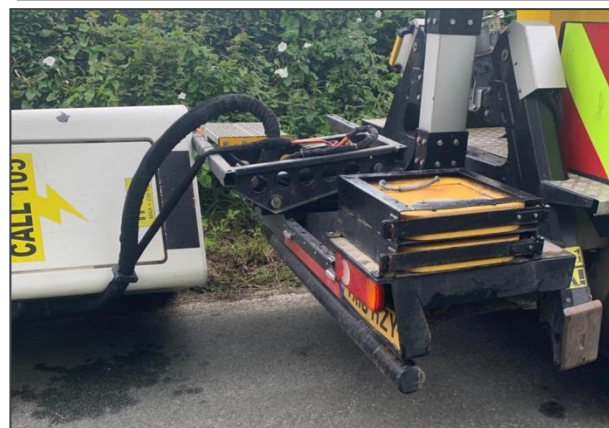
Typical bucket platform mounting with threaded bolt fixings in each corner